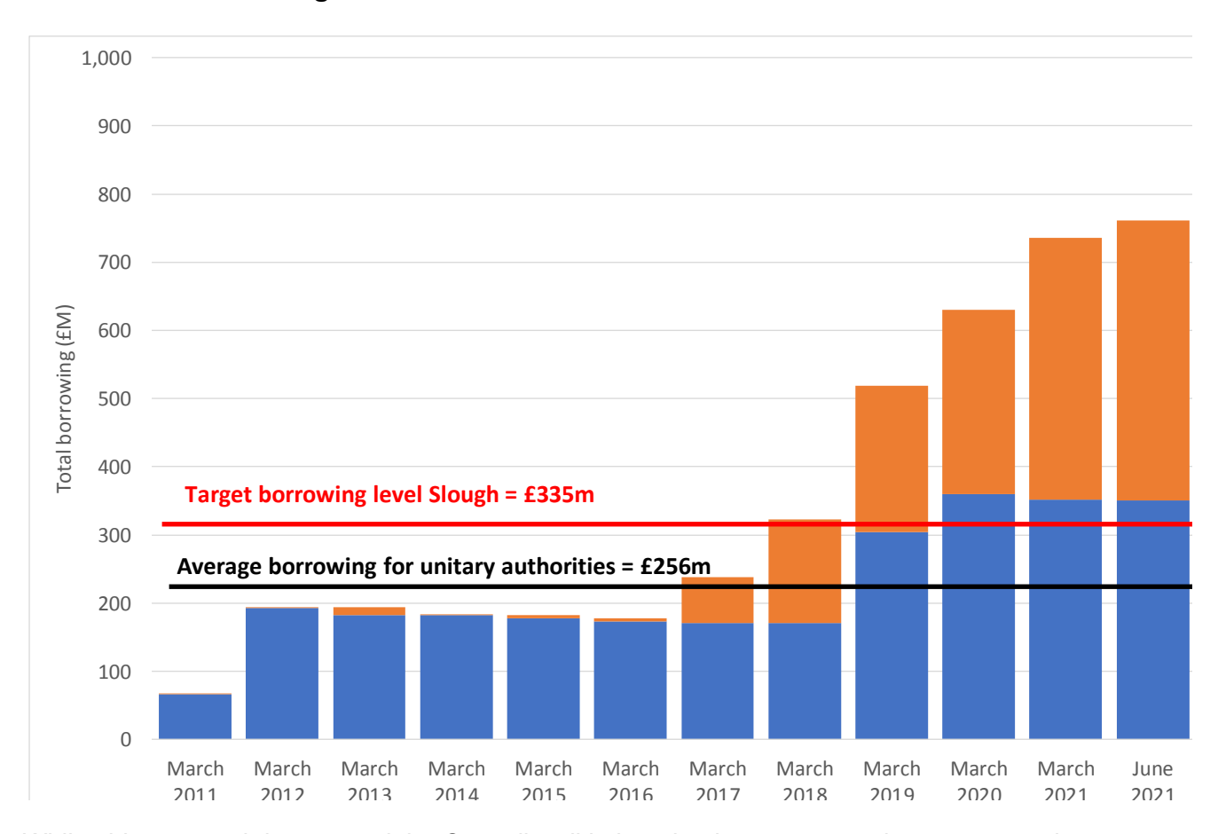
Chart 2 Total borrowing to date